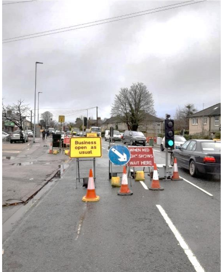
View of the Arbury Road shops area from the south

Please note that phase 2 is inclusive of the works currently underway in phase 1 and will commence after Christmas. As phase 2 commences, a second team will begin from No.127 and will work southbound towards the roundabout. As part of the phase 2 works, the team currently working between the roundabout and the substation will continue work in the New Year and then work northbound to meet up with the second team.