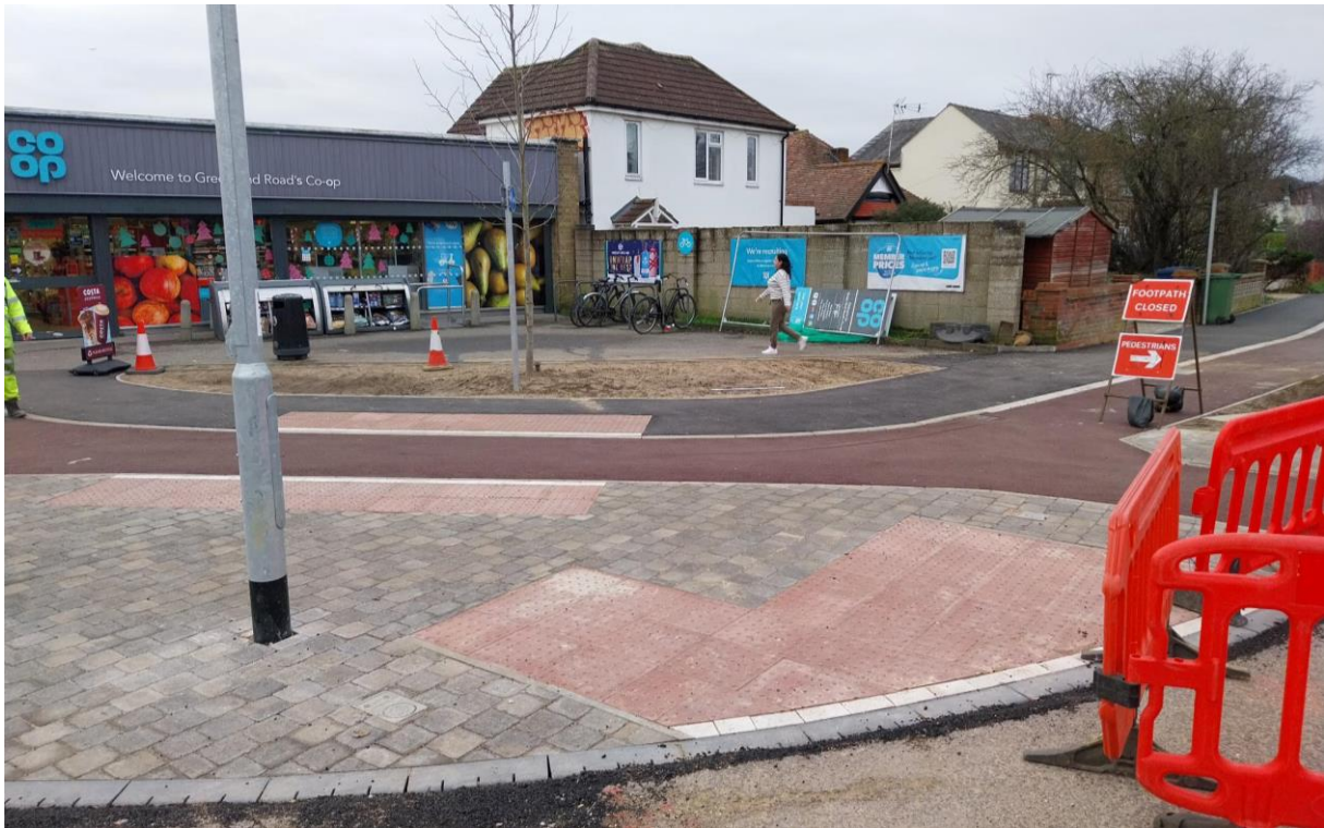
View of the south-east quadrant of King's Hedges junction

As works at the King's Hedges junction progress, the south-east quadrant is now open as far as the Co-op. Works are continuing along the side of the Co-op on Green End Road and will be completed early in the New Year. This will mean that work on the King's Hedges junction is more than 50% complete.