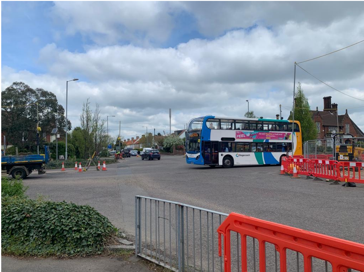
Earlier photo of the south-west quadrant (left) taken from the south-east quadrant

Work on the south-west quadrant is scheduled to start on 4 January 2024.