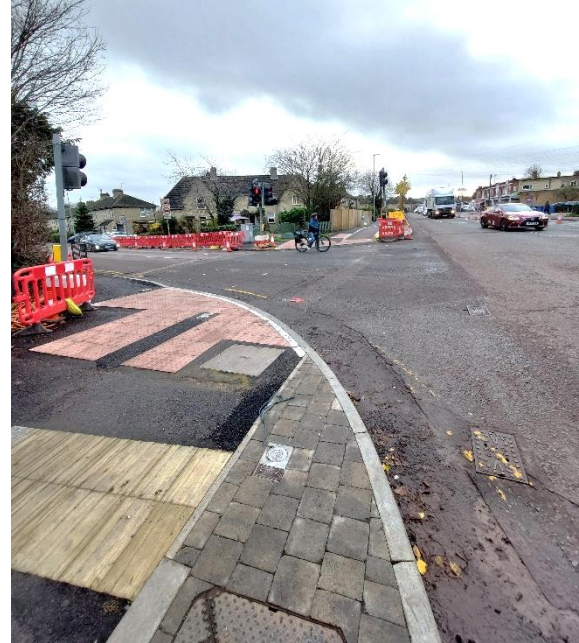
Union Lane / Milton Road junction

Access to Union Lane by vehicle will be via Green End Road/Scotland Road and/or via Chesterton High Street from the Elizabeth Way roundabout.