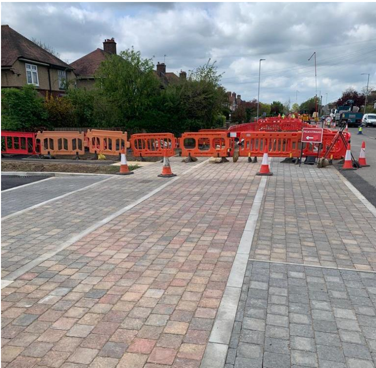
Copenhagen crossing at Kendal Way (photograph taken in May 2023).

Access to Ramsden Square by foot, cycle or vehicle will be via King's Hedges Road as shown in this map.